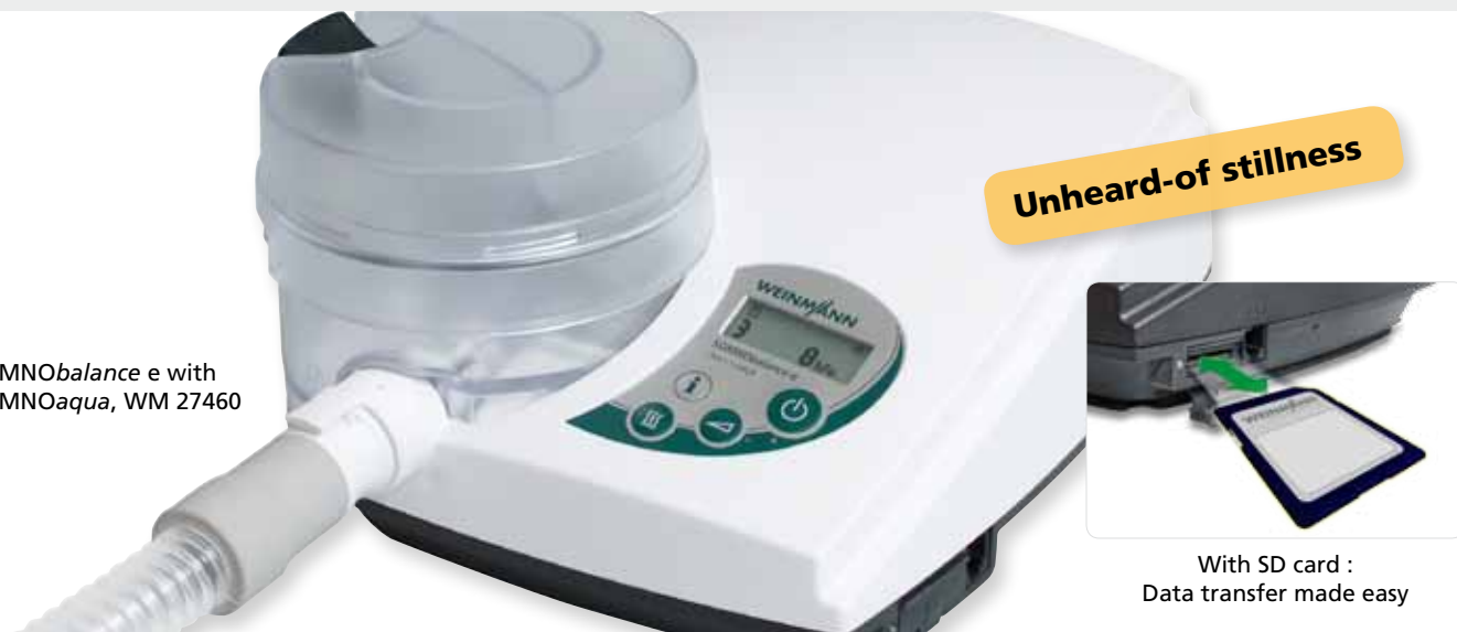
SOMNObalance e with SOMNOaqua, WM 27460

The autoCPAP therapy device SOMNObalance e is equipped with Obstructive Pressure Peak (OPP) technology which reliably distinguishes obstructive from central events. With automatic and continuous pressure adjustments in response to patient needs, the device offers great flexibility in therapy options. A selection of modes, which can be combined with intelligent softPAP pressure relief, makes SOMNObalance e even more flexible. The SD card helps to significantly optimize work processes.